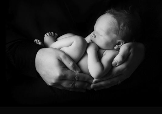
A Powerful Story of Christian Adoption

Best Way to Order LFL Resources: At <u>www.cph.org</u> or 800.325.3040. Shipping/handling applies to all orders. Quantity pricing on select resources.